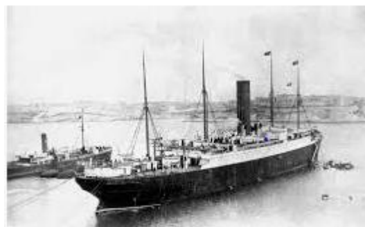
Figure 3 - Carpathia

It took three days, after leaving the scene of the disaster, for the Carpathia to reach New York, having had to negotiate pack ice, fog, thunderstorms and rough seas. The Carpathia docked in New York at Pier 54 at 9.30 am on 18th April where she was greeted by 40,000 people waiting at