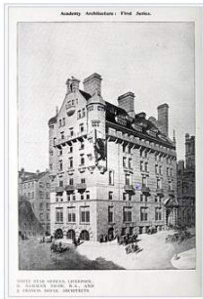
Figure 2 - The Headquarters of the White Star line then and now