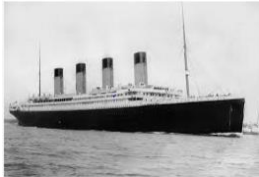
Figure 1- The Titanic

She had four triple cylindrical reciprocating inverted vertical direct acting surface condensing engines, (two reciprocating and one turbine), 24 boilers and three shafts, all manufactured by Harland and Wolff in Belfast. The workforce comprised 1,500 men and during the construction of the Titanic 6 workmen were killed and there were 246 injured, 28 severely. The Titanic was 852 feet long and 92 feet broad, her top speed was registered at 21 knots, and she was registered in Liverpool She sailed on her maiden voyage bound for New York, at noon on Wednesday 10th April 1912 via Cherbourg in northern France and Cobh in southern Ireland, with 992 passengers and 885 crew. At Cherbourg 274 more passengers embarked and 24 disembarked. Titanic arrived at Cobh at 11.30am on Thursday 11th April 1912 and a further 113 passengers embarked and 7 disembarked. Among the departures was Father Francis Brown a Jesuit Priest who was a keen photographer and took many photographs aboard Titanic including the last known photograph of the ship and there was an unofficial departure of a crew member, a stoker named John Coffey, a native Cobh, (still known as Queenstown in 1912), by hiding among mail bags being transported ashore.